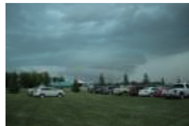
Right: The skies before the rain and hail came. A half hour later it was sunny skies for the rest of the event.

Free supper was served under the tent where residents, both past and present, along with visitors to the municipality enjoyed the festivities.