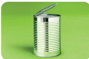
Steel food and beverage containers: Soup cans and pet food tins