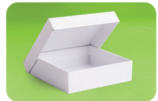
Cardboard and boxboard: Cereal boxes, cardboard boxes, and cardboard tubes