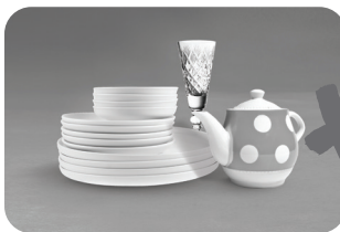
Dishes and ceramics