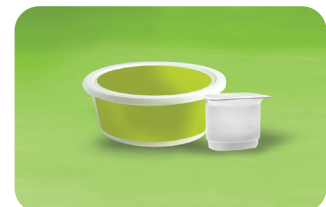
Plastic Containers: Plastic bottles and jars, laundry jugs, and yogurt tubs