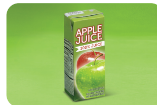
Cartons: Milk cartons, juice boxes, and soup cartons