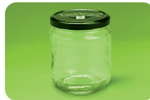
Glass bottles and jars: Clear and coloured jars and bottles