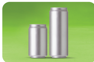
Aluminum food and beverage containers: Soft drink cans and sardine cans