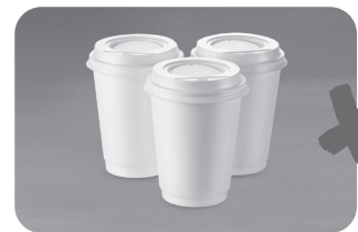
Take out beverage cups

Multi-Material Stewardship Manitoba 7th Floor, 259 Portage Avenue Winnipeg, Manitoba R3B 2A8 (204) 953-2010 | (877) 952-2010 (Toll Free)