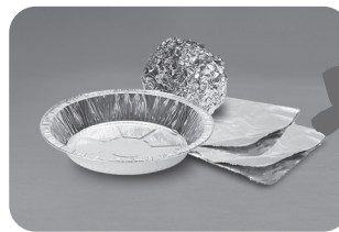
Aluminum foil, pie plates, and trays