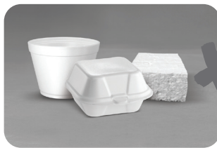
Foam packaging of any kind