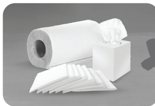
Paper towels, tissues, and napkins