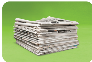
Printed Paper: Newspapers, magazines, flyers, and home office paper

These are some examples of types of recyclable materials accepted in your recycling program: